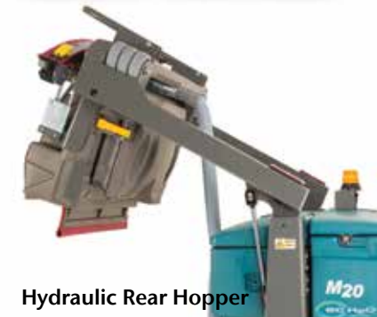
Hydraulic Rear Hopper