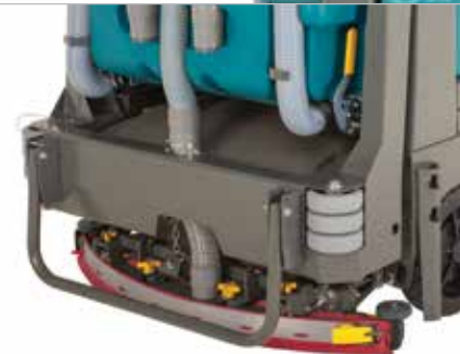
Dura-Track™ Parabolic Squeegee