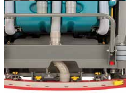
Yellow Maintenance Touch Points

Overhead guard protects operators from falling objects.