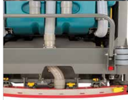
Yellow Maintenance Touch Points

Overhead guard protects operators from falling objects.