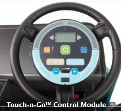
Touch-n-Go™ Control Module

▶ Touch-n-Go™ control module with 1-Step™ start button allows operators quick access to all settings without removing hands from the steering wheel.