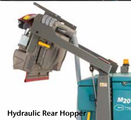
Hydraulic Rear Hopper