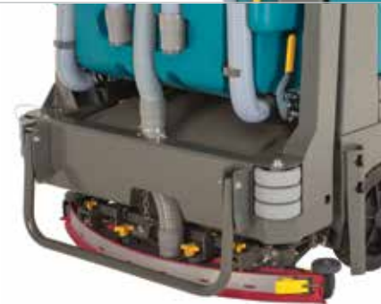
Dura-Track™ Parabolic Squeegee