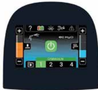
Pro-Panel® LCD Touch Screen (Option)